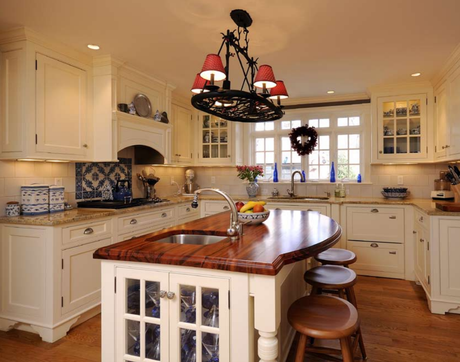
ABOVE The elegant kitchen features smart storage placement combined with specialty woodwork elements. Such carefully wrought detailing adds grace to the bathroom at right as well.