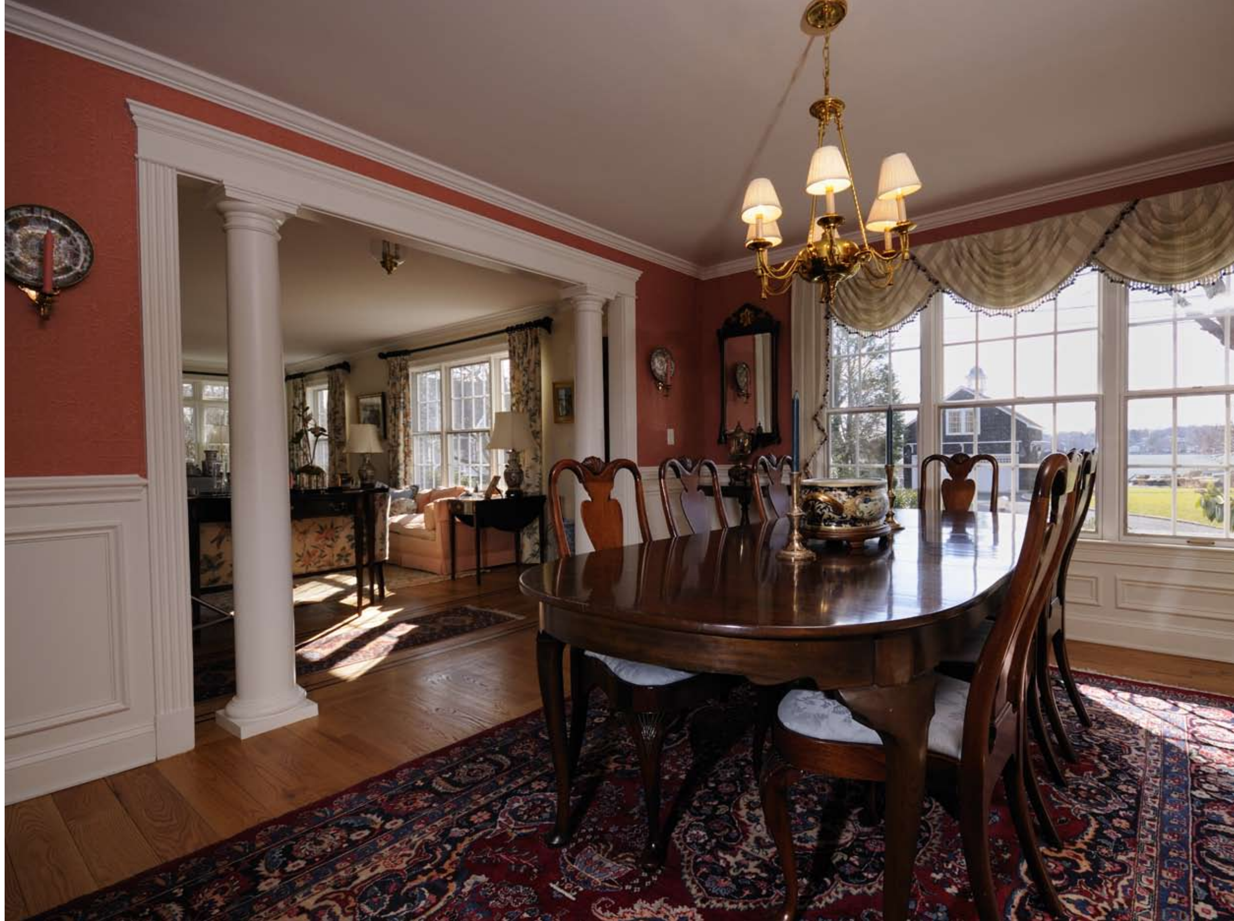
ABOVE Wide plank hardwood flooring in the renovated formal dining room complements traditional architectural details, including elaborate fluted molding, substantial columns and detailed chair rail. Windows frame picturesque views.

Exceptional attention was paid to the extraordinary masonry detail called for with Doyle Coffin Architecture's design. New