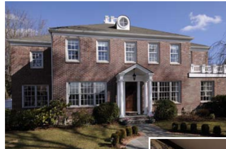
LEFT Classic proportions anchor the Georgian Colonial design, with well-chosen windows and a widow's walk to maximize the beachside location.