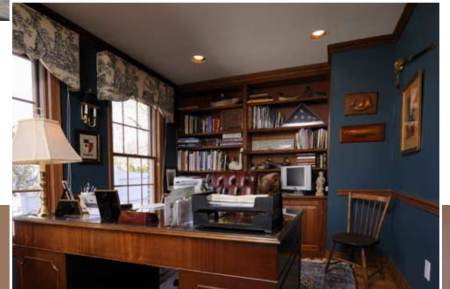
BELOW The beautifully honed mahogany staircase handrail presents a graceful sweep into the formal living room.